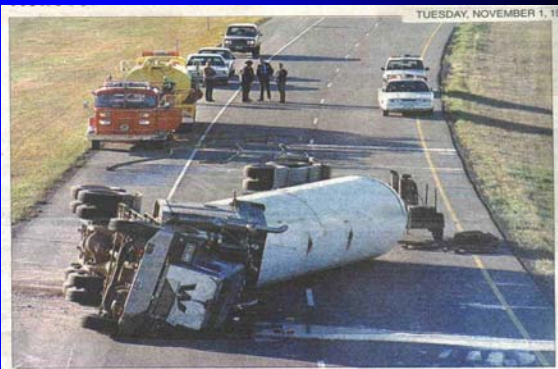
No one was injured when this semi-trailer truck carrying anhydrous ammonia rolled over Monday near the U.S. Highway 2 and 52 bypass. The anhydrous ammonia did not leak and caused no immediate danger. The driver received minor injuries. For more on the story, see Page B4.